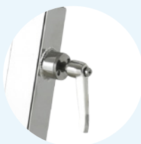
Fast settings Click & Turn