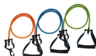
RESISTANCE BANDS 3 LEVELS AVAILABLE