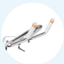
45° sport handlebar